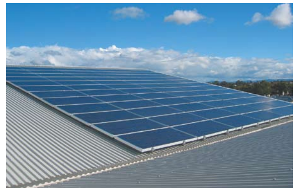
Medium sized system using multiple inverters