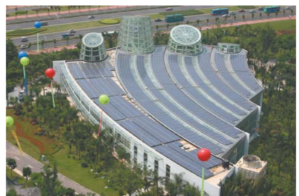
Large sized system using multiple inverters